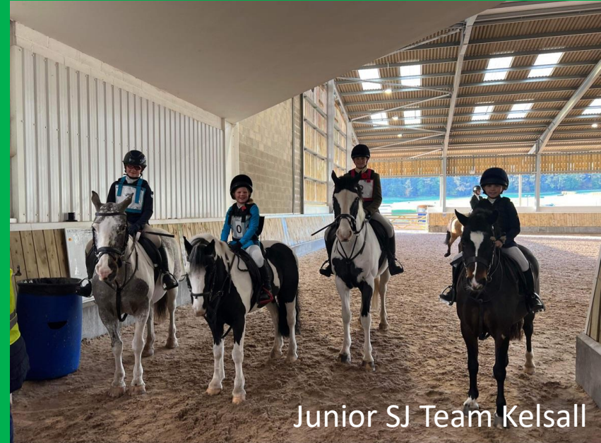
Junior SJ Team Kelsall