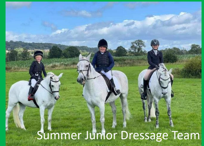
Summer Junior Dressage Team